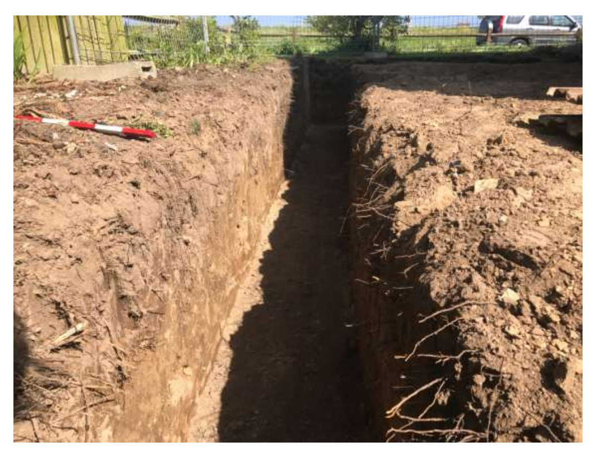
Plate 3. View of foundation trenching (looking E)