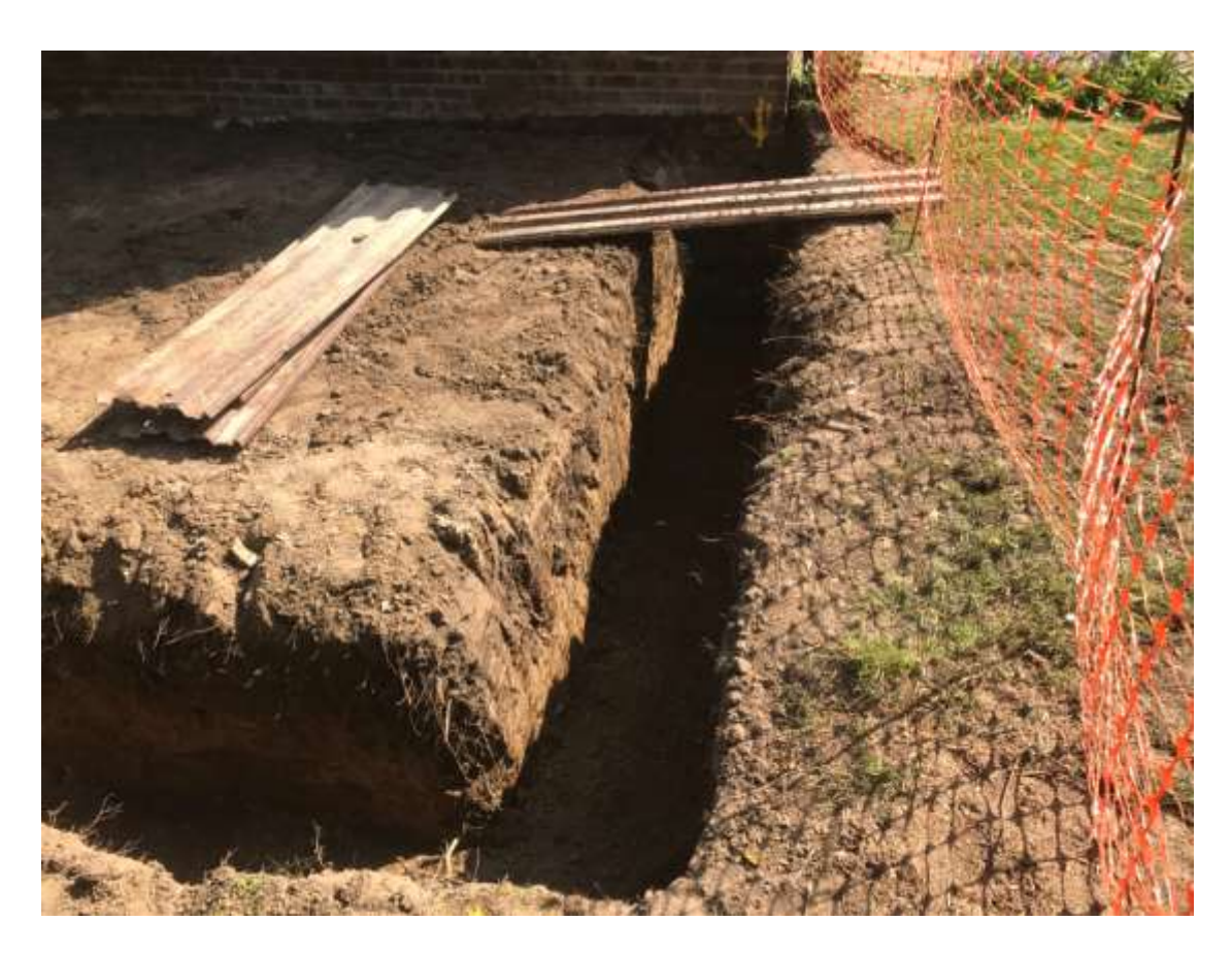
Plate 4. View of foundation trenching (looking W)