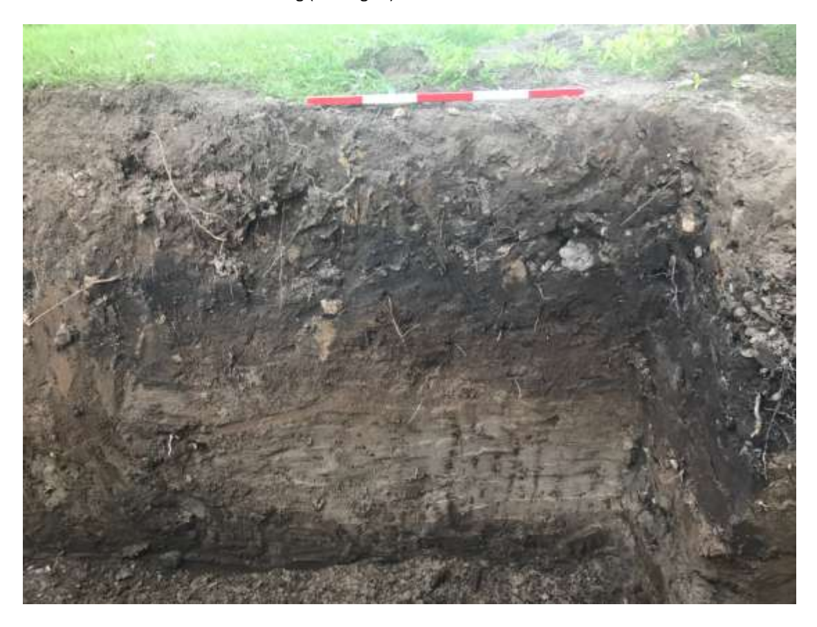
Plate 5. View of trench section (looking E)