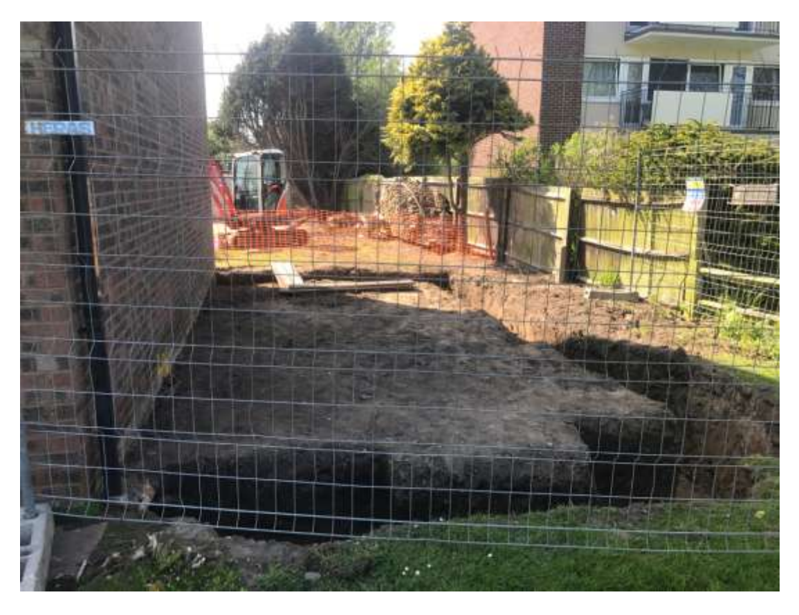
Plate 7. Completed foundation trench (looking W)