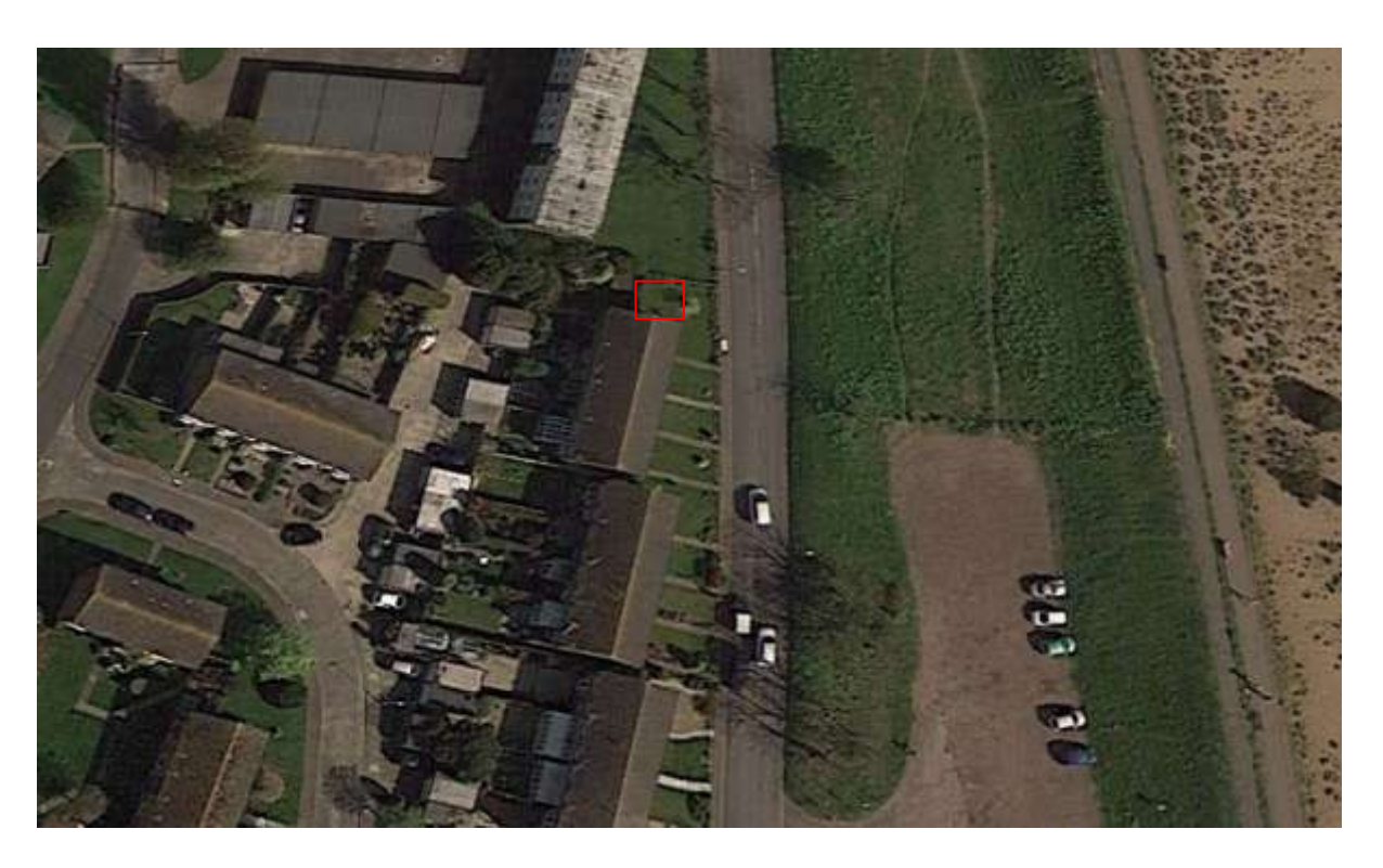
Plate 1. Aerial view of site (red target) showing the site prior to development.