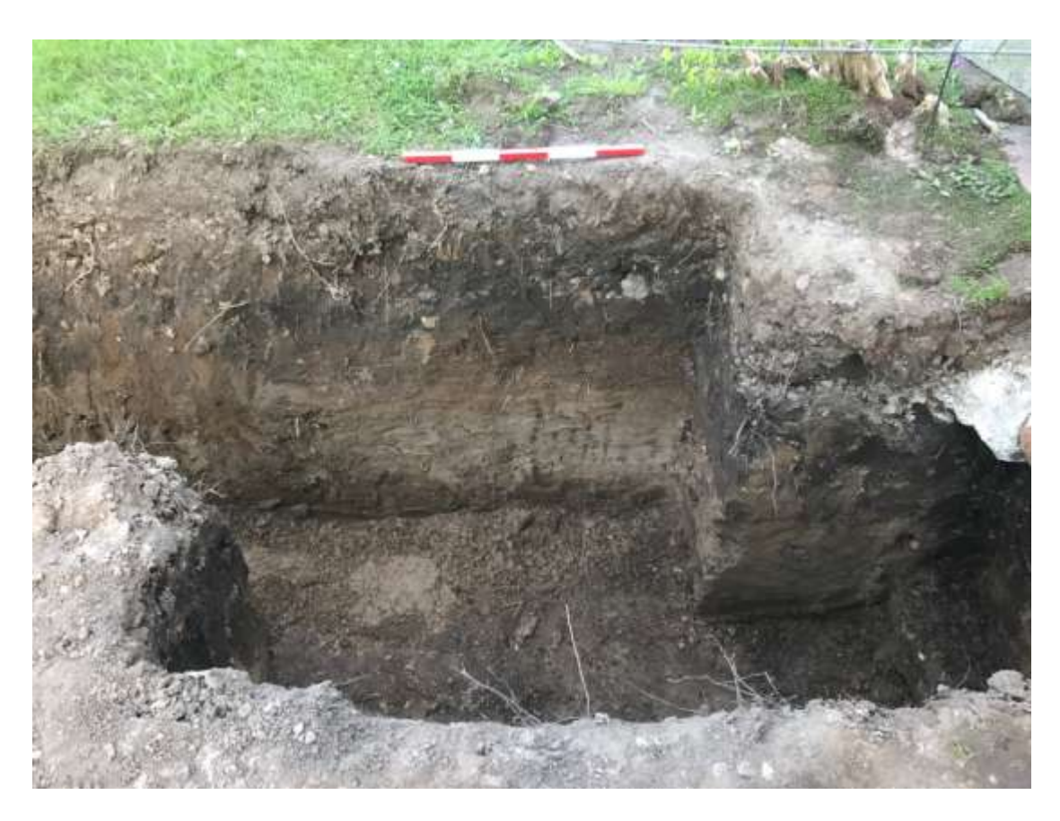
Plate 6. View of trench section (looking E)